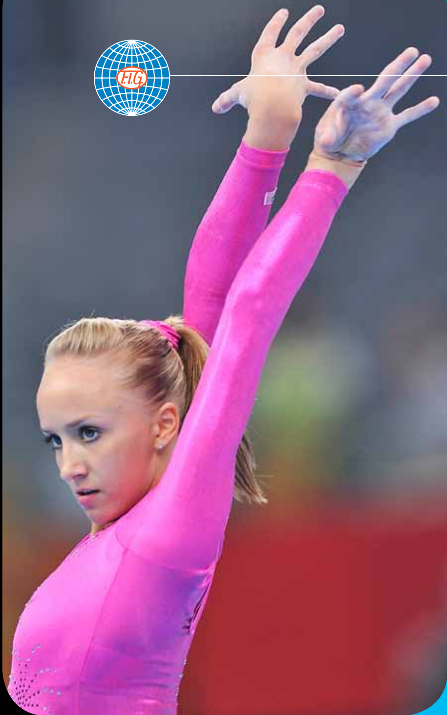
FIG Contact Information

For more information on the Fédération Internationale de Gymnastique