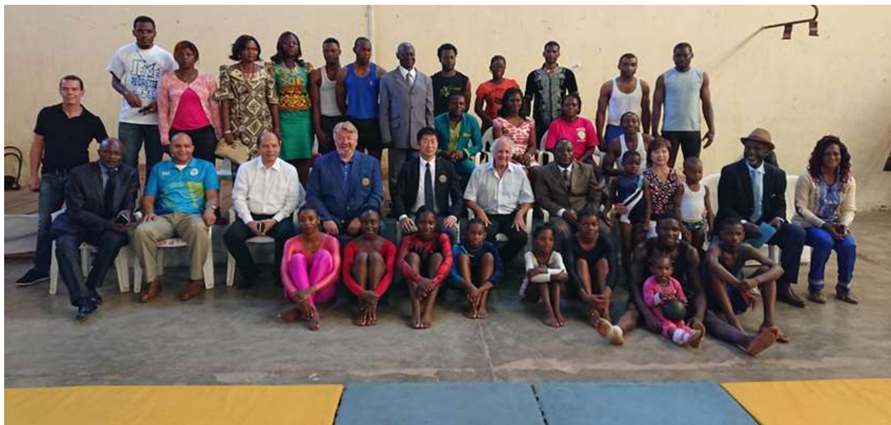
The Presidential Commission met Cameroonian gymnasts in Yaounde training on judo mat.

Some member Federations to which EC members belong may have to bear extra travel expenses and some may bear less. I would like to thank them in advance for their cooperation and understanding.