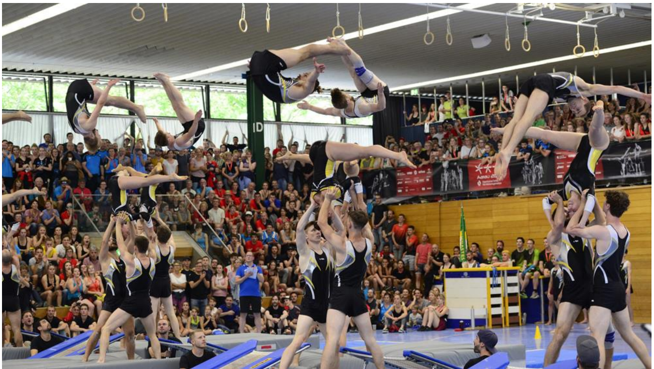
Swiss Federal Gymnastics Festival in Aarau