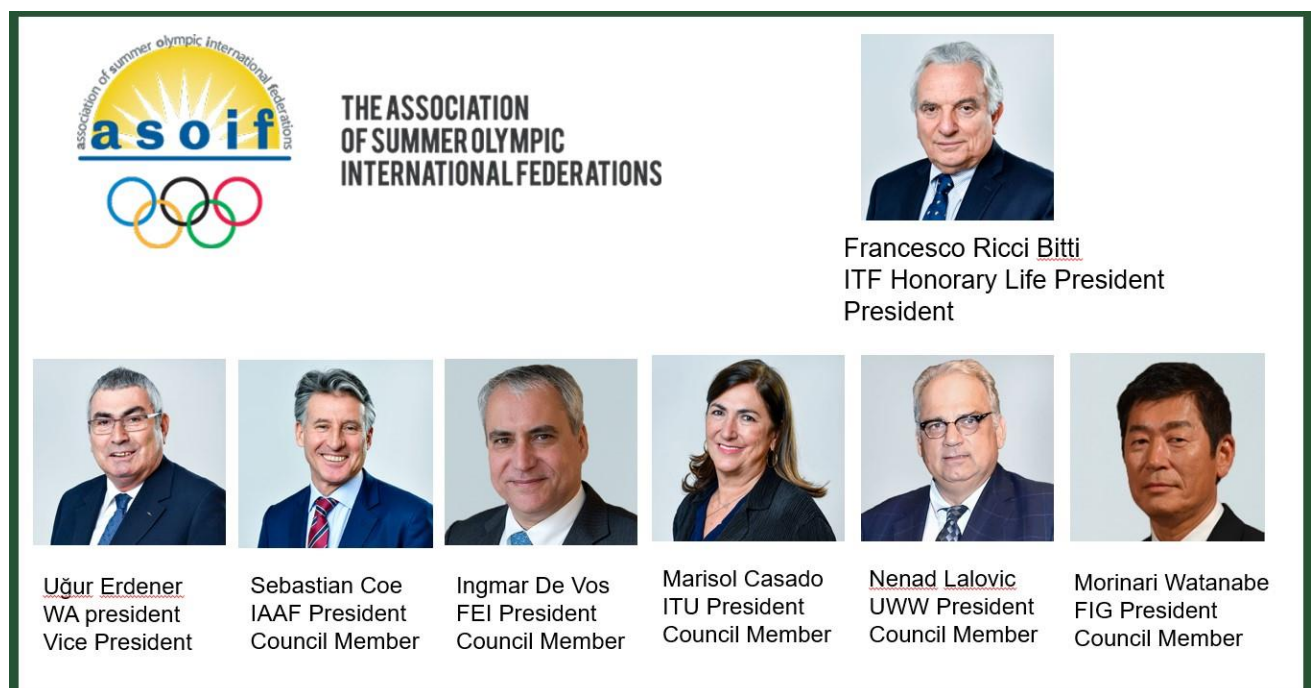
Composition of the ASOIF Council

This place on the ASOIF Council serves as an important recognition of this development perspective. And it is why I would like to celebrate this honour with the entire Gymnastics family across the world.