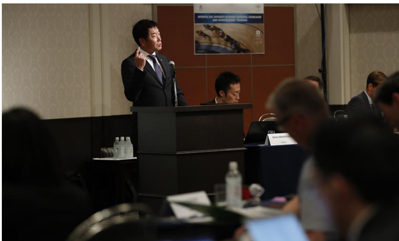
Forum on integrity in sport in Tokyo

Why put me in charge of boxing? It's because the world of sport understands that the FIG has made the necessary reforms to guarantee fair and honest judgements in Gymnastics.